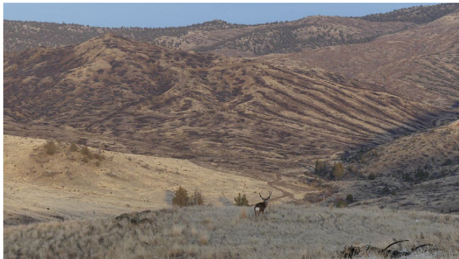
Mule deer buck in front of large juniper control project in Trout Creek watershed.